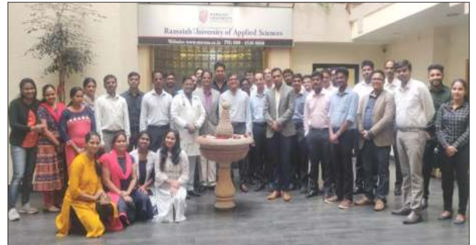
The Department of Paediatrics, Department of Cardiology, Medical College, in association with NCPIC - 2019, organised ECHMO Workshop, at the Advanced Learning Centre, on 5 th December, 2019.