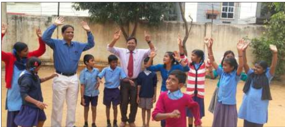
The Department of Paediatrics, Medical College, organised Micronutrient Assessment and Supplements at the Government School at Viveknagar, Bengaluru, on 11 th December, 2019.