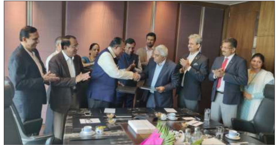
The MOU signing ceremony for "Assisted living Project", was held on 6 th December, 2019, between the Ramaiah Group & the Brigade Group