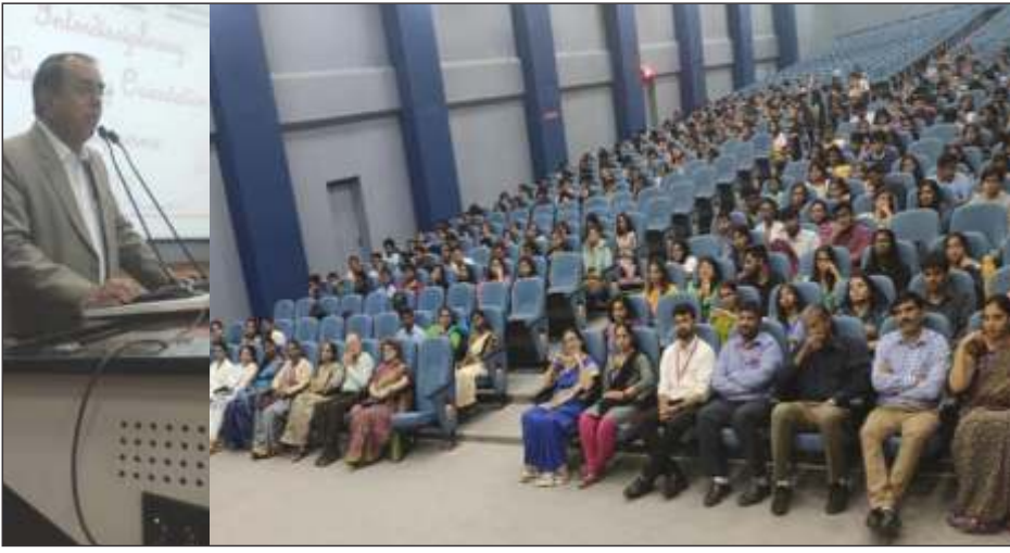
The Valedictory of Inter Disciplinary Community Orientation Programme (ID COP) 2019, was organized by the Department of Community Medicine, Medical College, in association with the Faculty of Dental Sciences, the Faculty of Pharmacy and the Institute of the Nursing Education and Research, held on 7 th December, 2019, at the Medical College Auditorium.