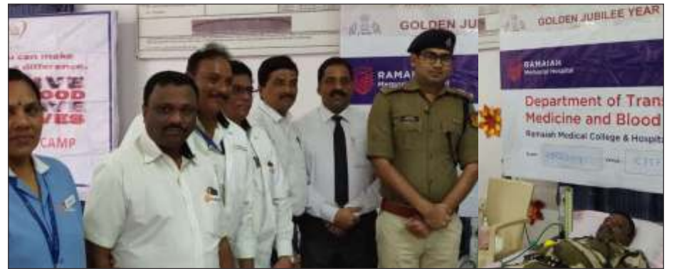
Blood Donation Camp , held by the Department of Transfusion Medicine and Blood Centre at the Institute of Technology, on 5 th December, 2019.