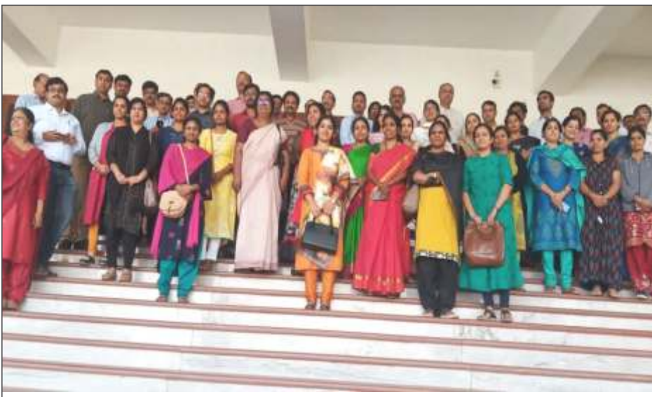
The State TB Cell, in association with the Department of Microbiology and Community Medicine, Medical College, organised the State Level Workshop for Medical Colleges, in establishing DR-TB wards and AIC Guidelines, on 16 th & 17 th December, 2019, at the Council Hall, Medical College.