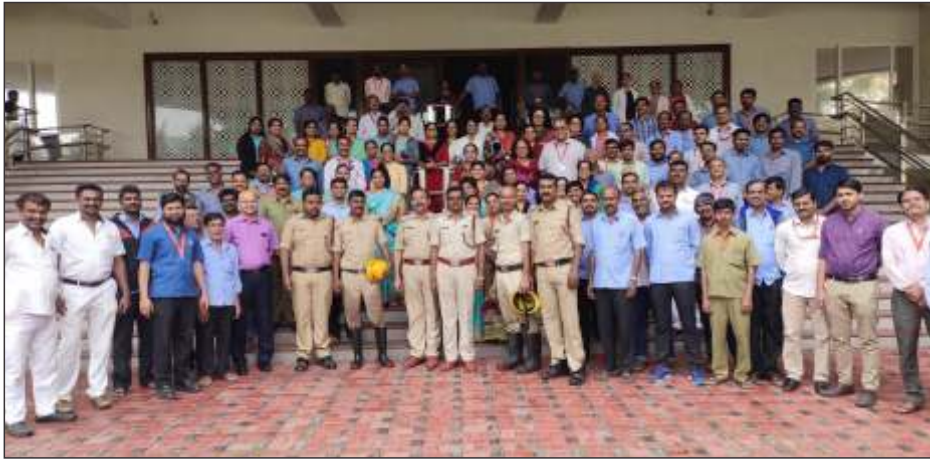
Fire Safety Training Programme , conducted by the Fire Service Department, Government of Karnataka, on 19 th December, 2019, at Medical College.