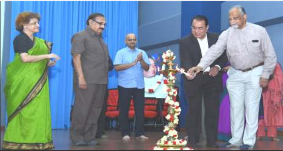
Abhinandana 2019 - The Annual Voluntary Body Donors Meet, was held on 1 st December, 2019, at the Medical College Auditorium.