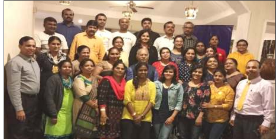
The Management of Memorial Hospital had arranged a Leadership Workshop on "Building High Performance Teams" on 13 th December, 2019, at Windflower Resort, Devanahalli.