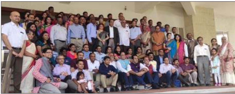
The Alumni Get-together Meet of 1994-95 batch of the Medical College was held on 28 th December, 2019, at the Medical College Council Room.