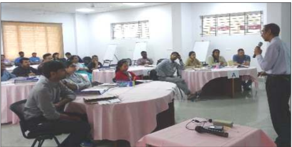
The Department of Emergency Medicine, Medical College conducted the 4 th Advance Trauma Life Support (ATLS) Provider Course from 5 th to 7 th December, 2019, at the Medical Education Unit (MEU), Medical College.