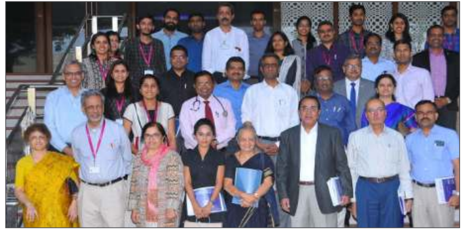
The Ramaiah National Conference on Guidelines for Institutional Healthcare Delivery in India, organised by the Public Policy Center, and the Medical College on 20 th December, 2019, at the Medical College Board Room saw participation from eminent medical professionals from several cities in the country. The focus is to come up with a final draft of recommendations towards framing of Medico-Legal guidelines for Healthcare Institutions in India.