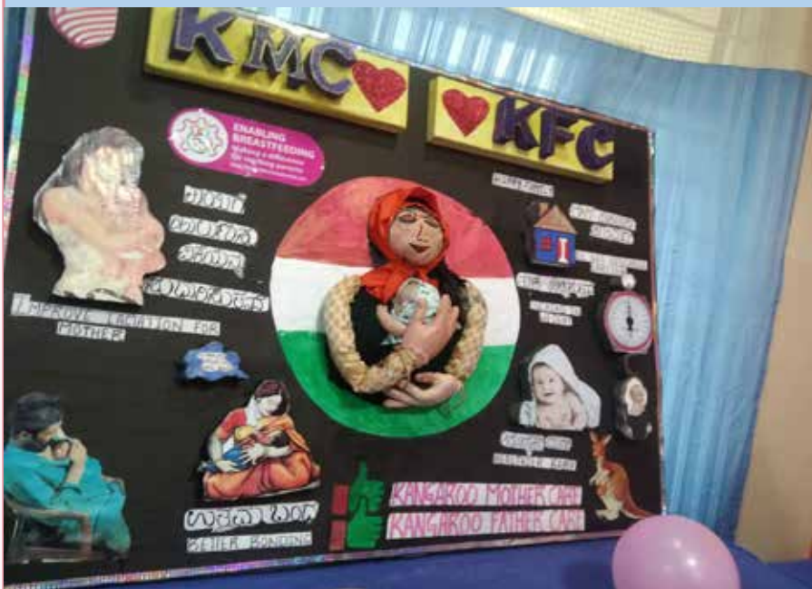
Exhibition on the occasion of world breastfeeding week