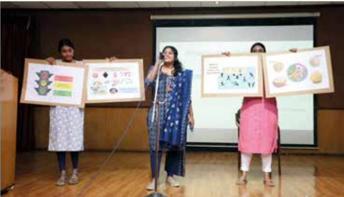
Department of Endocrinology organized an awareness programme on World Pre-diabetes Day at Ramaiah Memorial Hospital on August 16th, 2023. The residents performed a skit and conducted a poster presentation competition on Pre-diabetes.