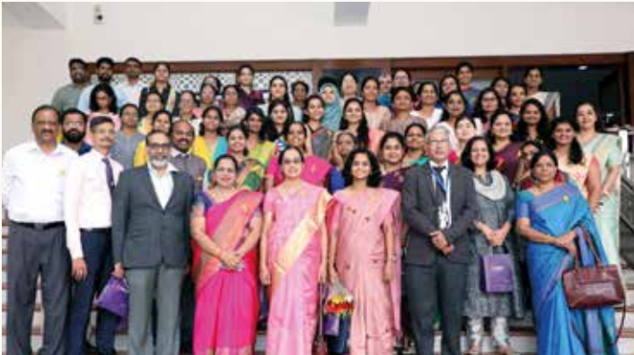
On the occasion of Childhood Cancer Awareness Month, the Department of Pathology conducted CME on 'Pediatric Sarcomas'.