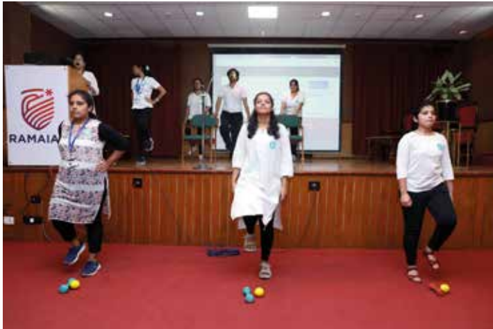
The Department of Physiotherapy celebrated World Physiotherapy Day on 8th September, 2023 at Ramaiah Memorial Hospital.