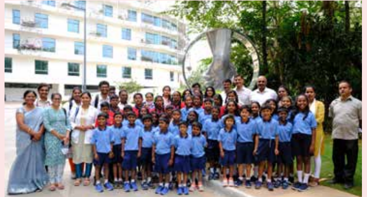
Ramaiah Memorial Hospital organised Health Check-up at SLK Software for their School Children.