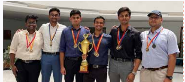
Ramaiah relay team won bronze medal at INVICTUS fest.