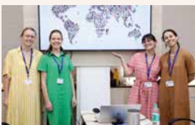
Presentation by Ghent University Students was organised on 26th October, 2023.