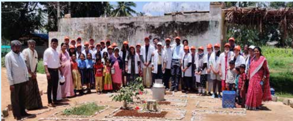
Thanksgiving: students voluntarily planted saplings, painted the school and Anganwadi buildings, gifted stationary, and first aid kits to the community.

the school and Anganwadi buildings, gifted stationary, and first aid kits to the community. The urban component of the program for the 3 rd year MBBS students comprised of visits to the water treatment facility at T.K.Halli, sewage treatment plant and milk dairy at Yelahanka. During the Valedictory functions held on the 28 th and 29 th July, the students presented their experiences, learning's and insights.