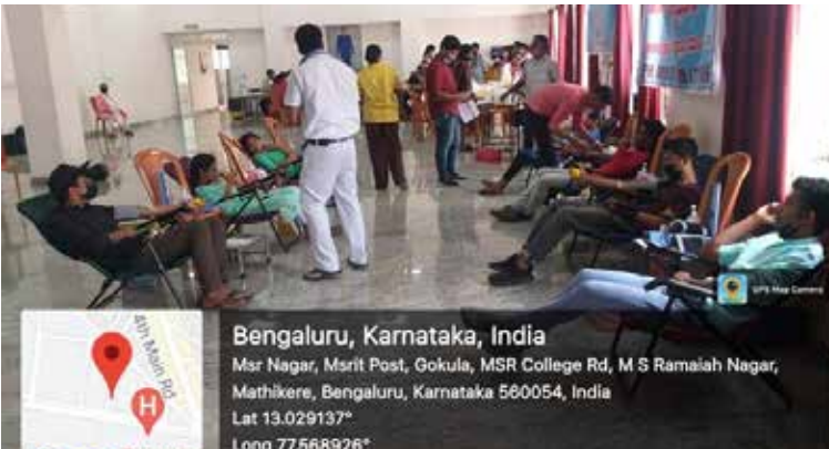
Bengaluru, Karnataka, India Msr Nagar, Msrit Post, Gokula, MSR College Rd, M S Ramaiah Nagar, Mathikere, Bengaluru, Karnataka 560054, India Lat 13.029137° Long 77.568926°

On the occasion of International Women's Day on March 15, 2022, RINER organized an Essay competition on Gender based violence: Why Women Are Targeted and Panel discussion on Women Empowerment – Thought from Indian States for Nursing Students.