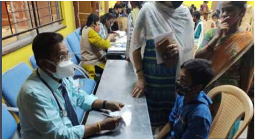
Department of Pediatrics, Ramaiah Medical College in association with IAP-BPA conducted health education and health screening camp at Abhalashrama, Basavanagudi held on 6 th March 2022