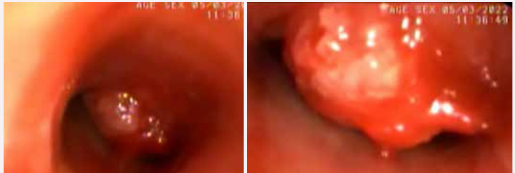
Flexible bronchoscopy – showing a fleshy mass in the lower end of the trachea causing central airway obstruction

advancements and the development of flexible bronchoscopy in the 1960s. But with an increase in incidence and detection of thoracic malignancies like lung cancer, the use of rigid bronchoscopy (with a few tweaks in the apparatus and major advancements in video processing) has come back in vogue. The advanced rigid