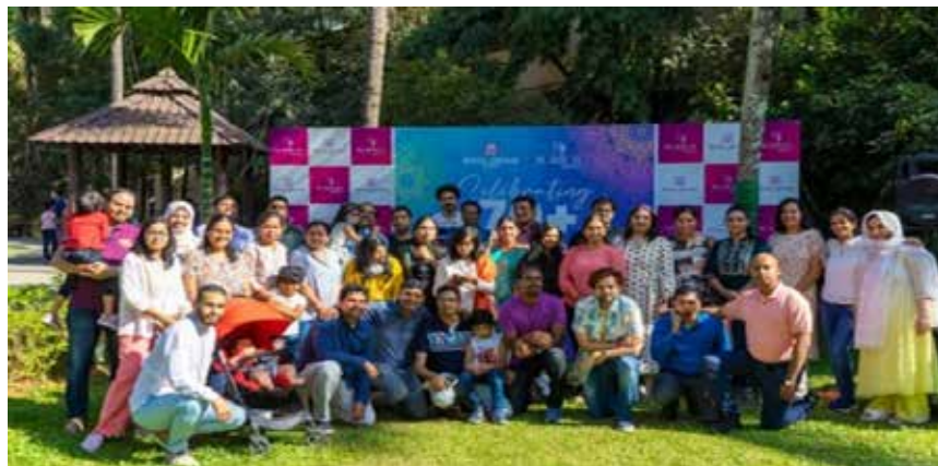
2003 batch MBBS students had a reunion on February 27, 2022 at Hotel Royal Orchid resort Bengaluru. More than 40 alumni met after a period of 12 years, a unique feat indeed.