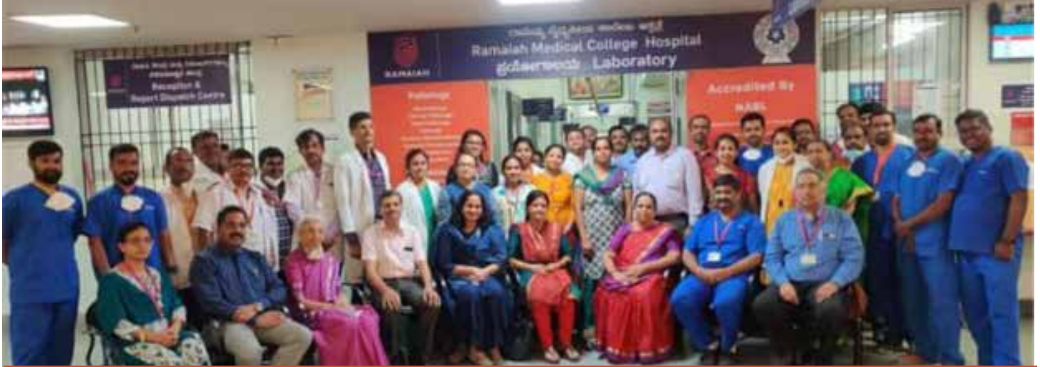
Three cheers to our NABL team