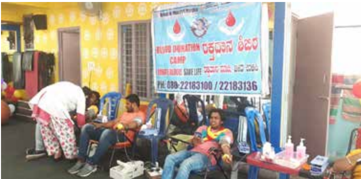
Ramaiah Blood Bank organized Blood Donation Camp at Fitness Impact Gym Basaveshwara Nagar, on the occasion of Punith Rajkumar's Birthday