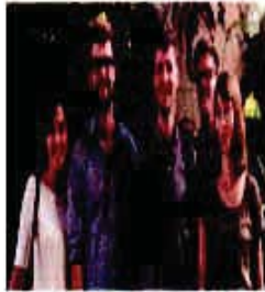
Impressions of Medicine and Life in India