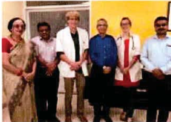
Two Medical Interns from Ghent University, Belgium called on CE along with Community Medicine Department faculty and IRO