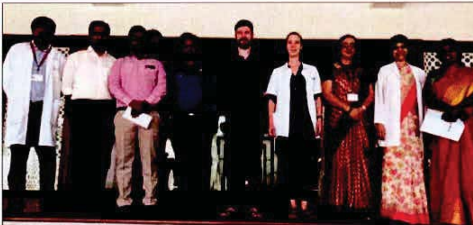
Successful completion of Observership by Ghent University students on an exchange program at RMC and Hospital.